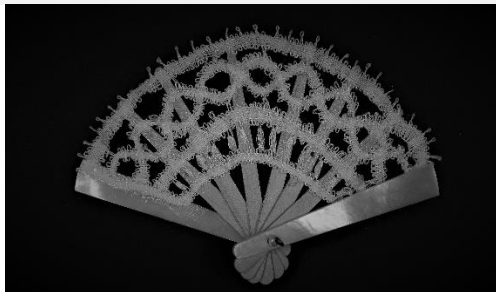
Abbeyleix Pillow Lace Fan

We will have a pop up exhibition, 'Handmade with Care', on the history of enterprising women of Laois through crafts early in the year. This will also include several workshops. 2019 will be a dynamic year for Heritage House with many different exhibitions and activities. So keep an eye out for something that may suit you.